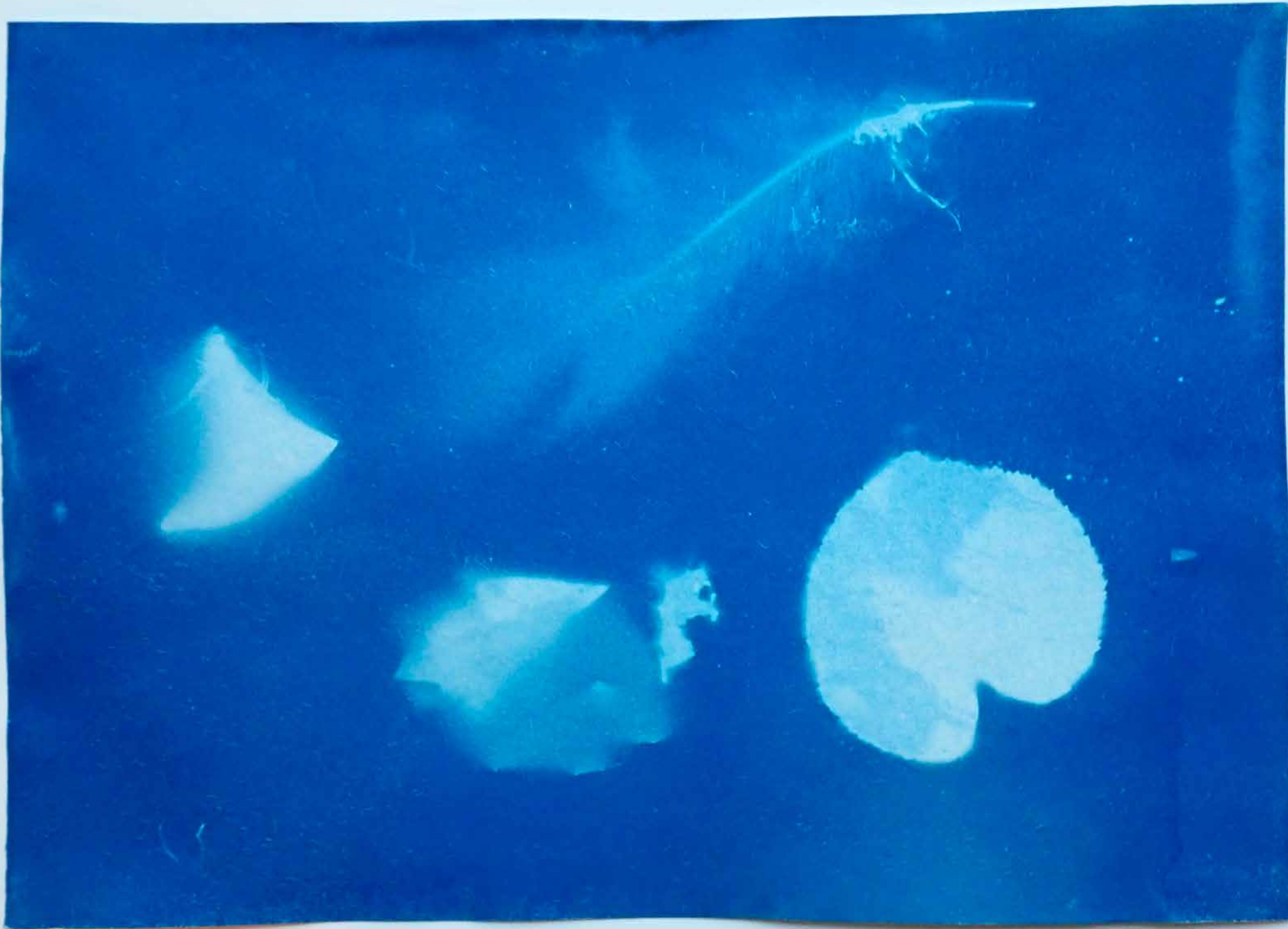
A blueprint sample from Helsinki, November 2019