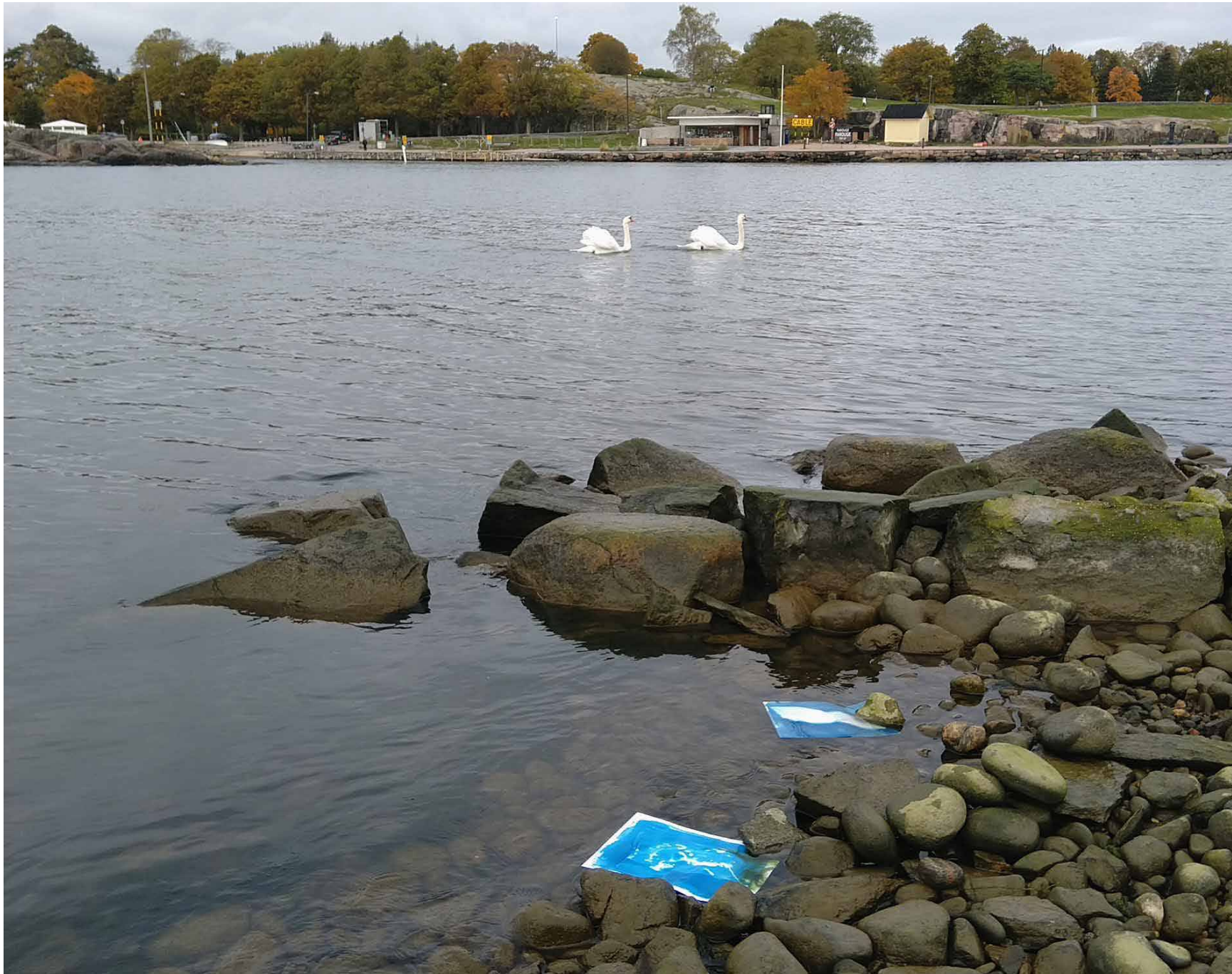
Developing cyanotypes in Helsinki, November 2019