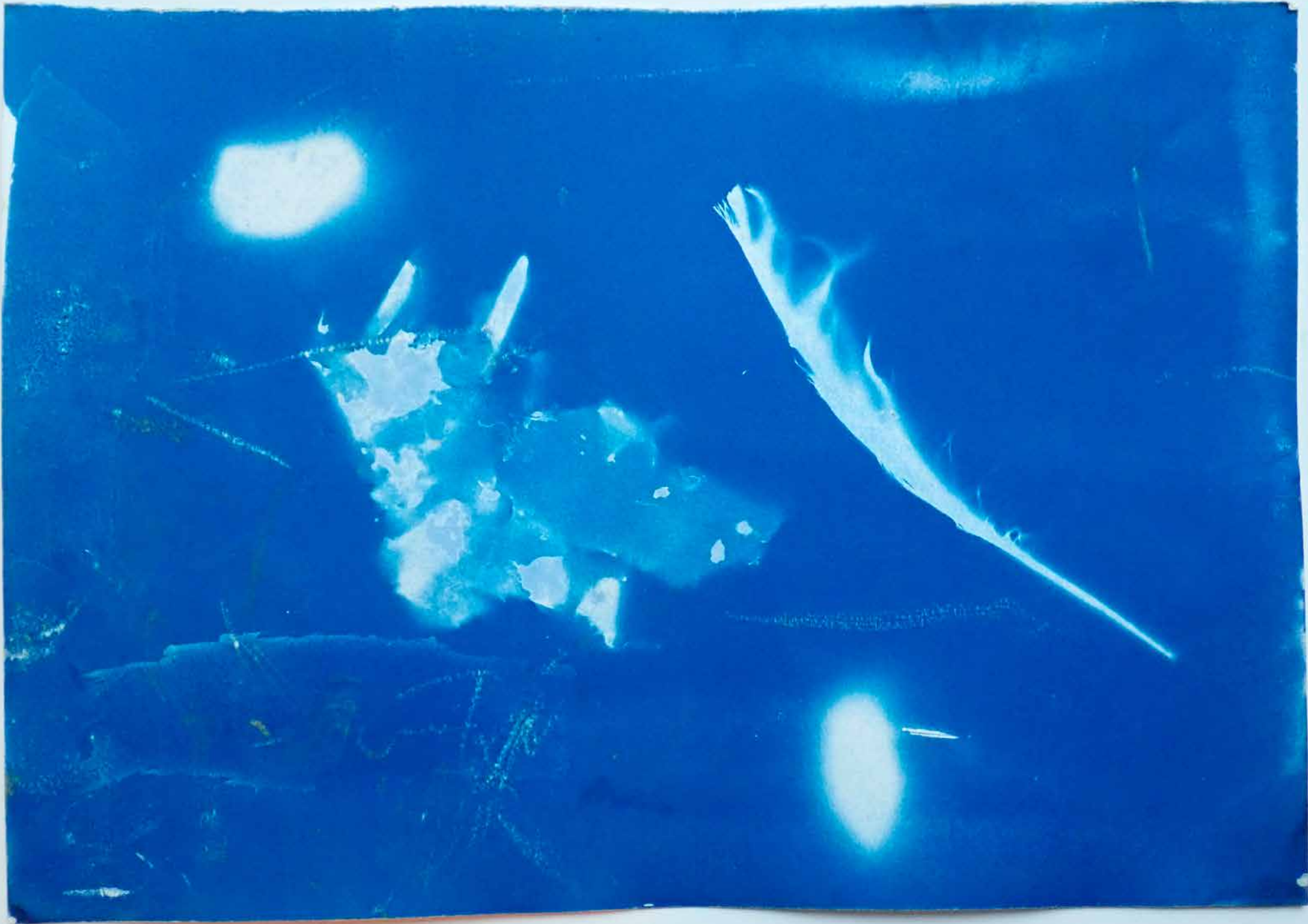
A blueprint sample from Helsinki, November 2019