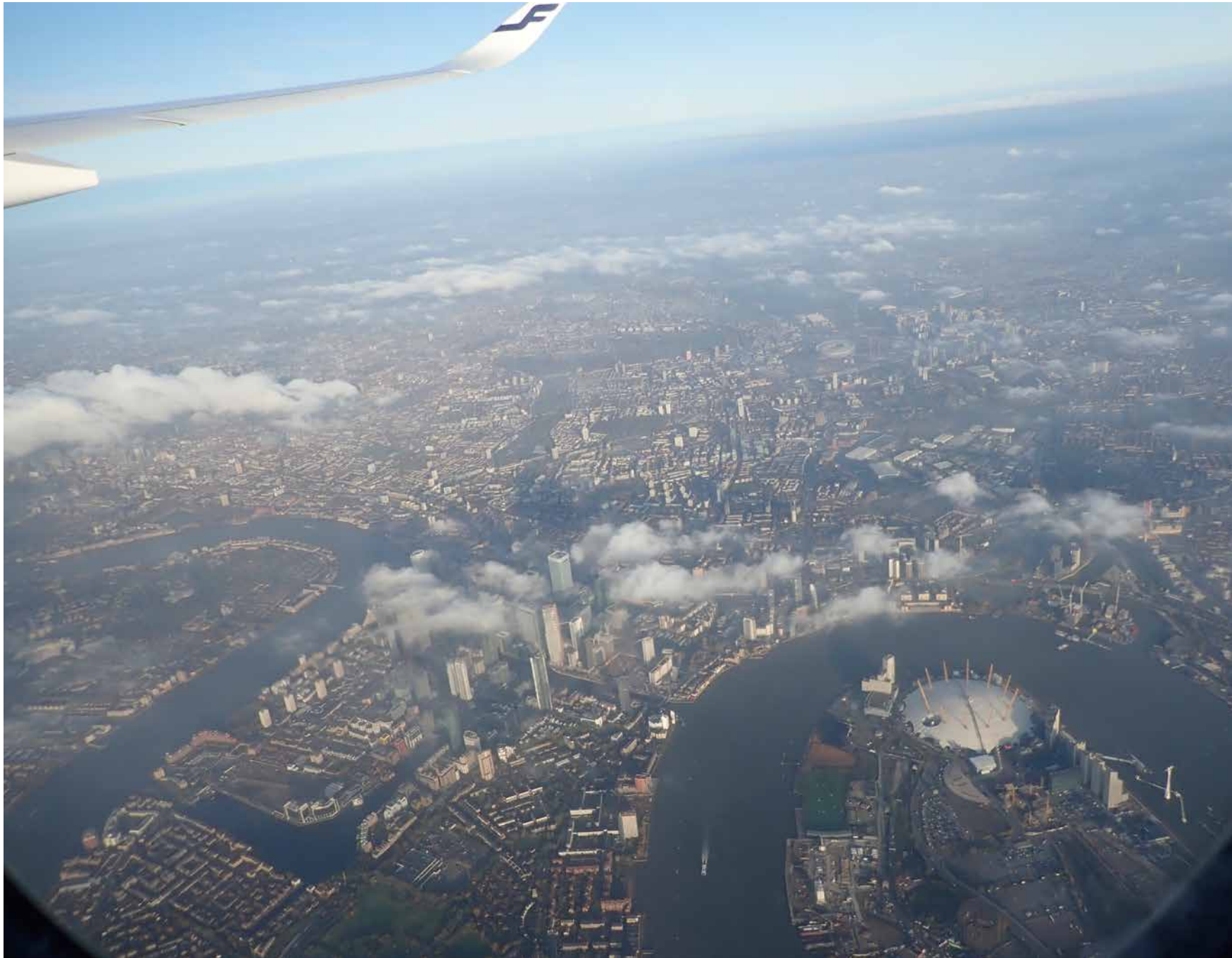
The river Thames 6.11.2019