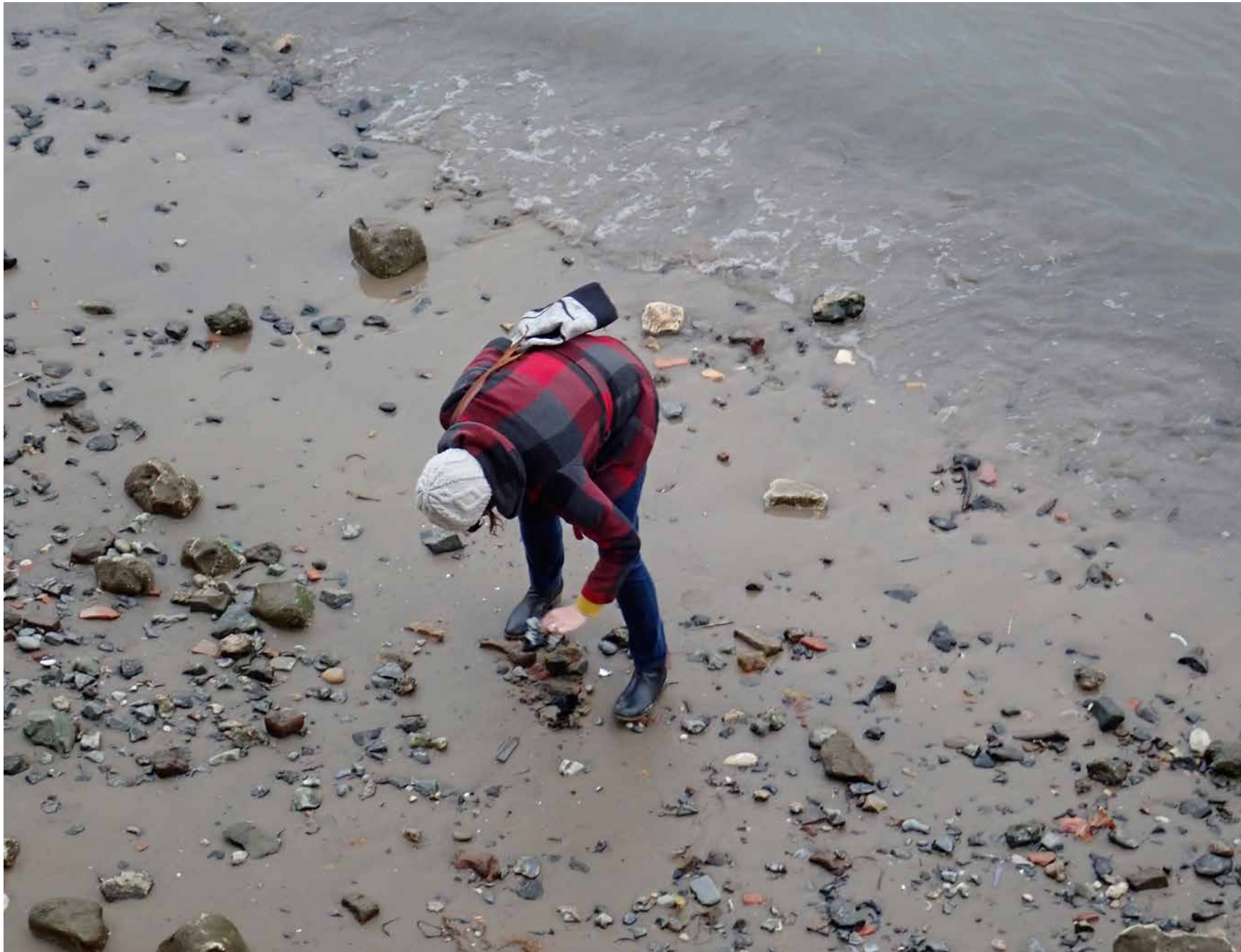
A local Mudlark at work, Southwark, London 6.11.2019