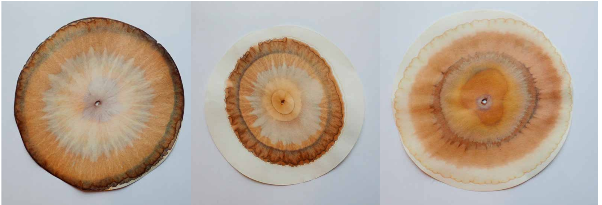
Mud chromatograms from Helsinki, November 2019