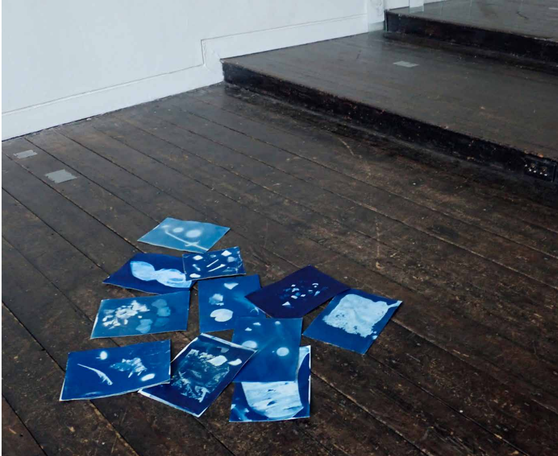
Blueprints from Helsinki on the floor of the Beaconsfield gallery, London 6.11.2019