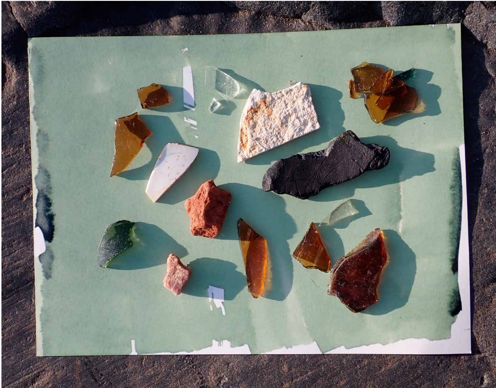
Exposing a blueprint in Helsinki, November 2019